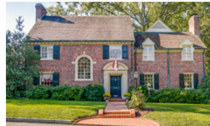
3. 4801 Pocahontas Avenue