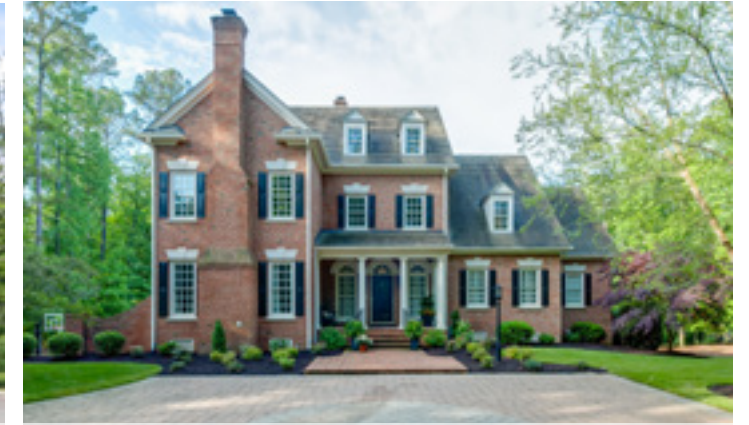
2. 311 Randolph Square Parkway