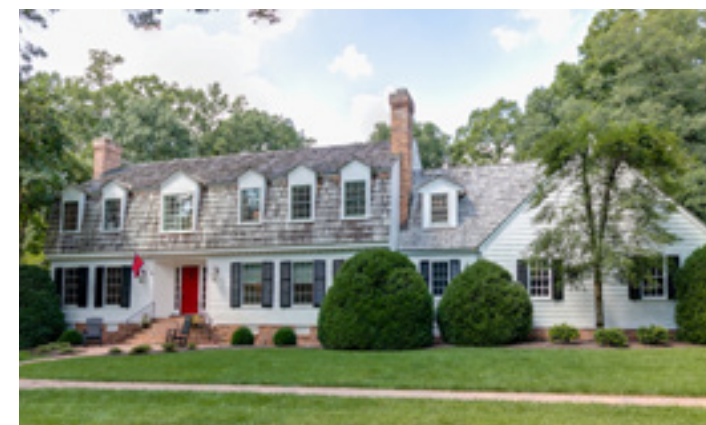
5. 414 Kilmarnock Drive