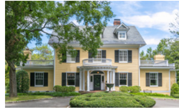
1. 6300 Three Chopt Road

THE STEELE GROUP SOTHEBY'S INTERNATIONAL REALTY