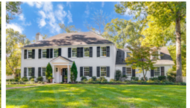
4. 8915 Norwick Road