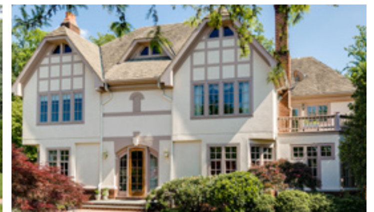
6. 4917 Lockgreen Circle